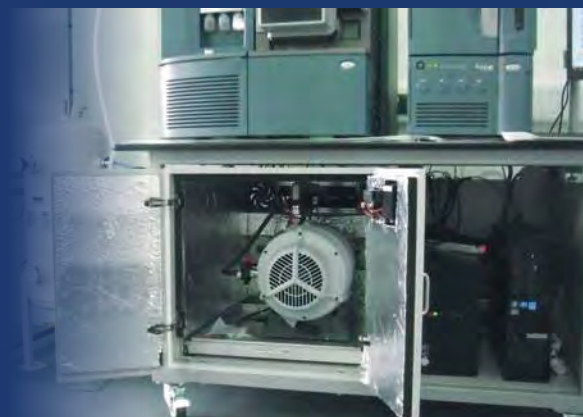
MS bench with Scroll pump anti-noise unit.