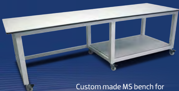
Custom made MS bench for Sheffield University.