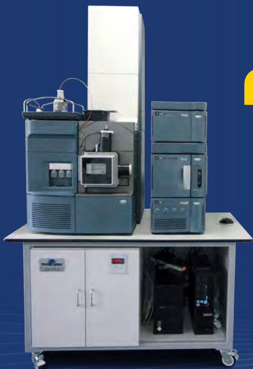
Waters Xevo Q-ToF with vacuum pump noise suppression enclosure.